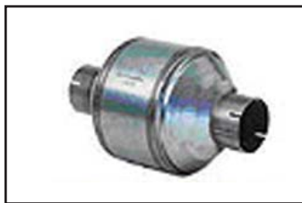
Diesel Oxidation Catalyst

More than $138,000 of Clean Air School Bus funds was awarded to Webster Central School District to cover 100% of the purchase and installation costs of diesel oxidation catalysts (DOCs) and/or crankcase filters on 74 of its buses. The DOCs selected for use have been verified by the EPA to cut tailpipe exhaust concentrations of PM by 20%, CO by 40% and HC by 50 %.