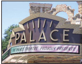
Palace - marquee

"We were surprised and pleased with how easy it was to get the our incentive grant from NYSERDA for the Palace Theater's new marquee. Their consultant, SAIC, helped us through the whole process - including estimating how much energy we will be saving for years to come. While the new marquee may look like the original marquee, thanks to NYSERDA's help, we were able to make all of the electric features extremely energy efficient."