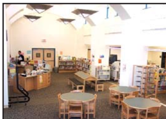
Effective daylighting, as shown here in the library, can significantly improve student productivity.