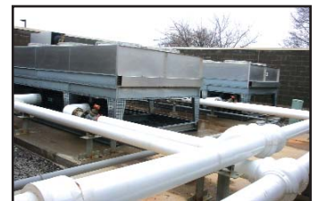
New high-efficiency cooling systems will save the District money and provide a more comfortable environment for the buildings' occupants.