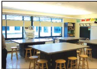
Efficient lighting and controls make the art room a more comfortable learning environment.